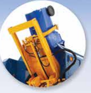
Fast cycle times, continuous packing and 50 degree minimum dump angle.