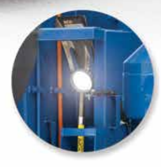
Three large LED work lights provide ample illumination.