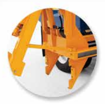
Lift arm service prop makes service and maintenance safe and easy.