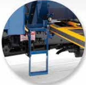
Folding ladder allows for convenient hopper access.