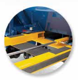
Large non-slip platform provides a safe and stable hopper access.